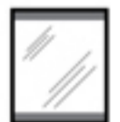
SIS-GCB1709 Glass Cutting Board