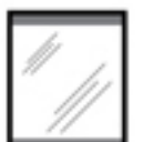
SIS-GCB1709 Glass Cutting Board