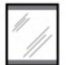
SIS-GCB1709 Glass Cutting Board