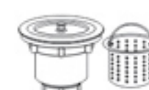
SIS-S01 Deluxe Strainer & Basket Brushed Nickel