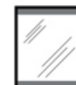
SIS-GCB1709 Glass Cutting Board