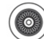
SIS-S06-04 Disposal Flange Brushed Nickel