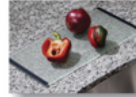
01 Cutting Board