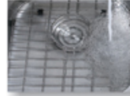
01 Bottom Grid