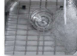
01 Bottom Grid