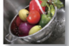
01 Salad Bowl

This model is made from durable 16 gauge 304 premium stainless steel, highly resistant to heat, most household stains, and rust for the life of the product.