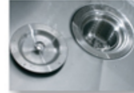
01 Strainer & Basket