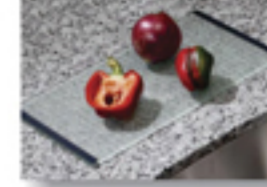
01 Cutting Board